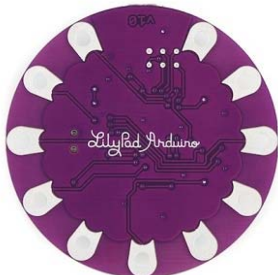
LilyPad Arduino USB (rear)